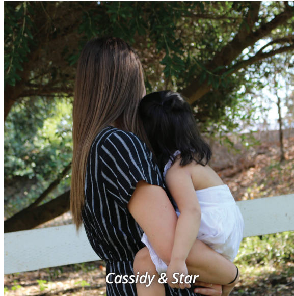
Cassidy & Star

My former foster daughter "Star" (name changed to protect confidentiality) taught me just that. Star was a toddler when she came to stay with me for 3 weeks. During this time, we would