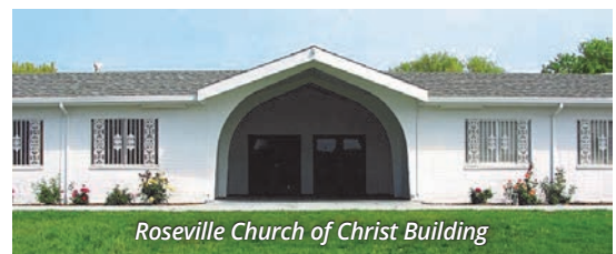
Roseville Church of Christ Building

The Roseville Church of Christ is always there for Agape. They've opened up their building for resource parent training and for many in-person fundraising events over the years. They've held yard sales for Agape, raising thousands of dollars. They give financially to Agape every month. And for the last two years, when we couldn't have in-person events, they've opened up their parking lot and kitchen to host our Crab & Go drive-thru event, and provided many volunteers to help with the event. Thank you, Roseville Church of Christ!