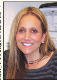
Agape Villages' Program Director