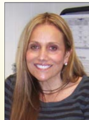
Agape Villages' Program Director

In October, our parents in the East Bay region will receive training in Foster Parents' rights and procedures, and in the Sacramento and Central Valley Area , parents will be trained on Independent Living Skills. Our trainings are wonderful opportunities for our foster parents to increase their skills and share ideas with others.