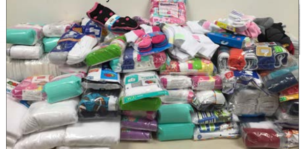
Items donated by the Church of Christ in Merced

The enclosed items come with love, from the church of Christ that meets at 4th & P Streets in Merced, Ca. We pray they meet a need. 😊 Have a great day!