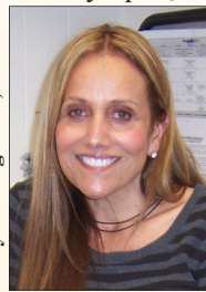
Agape Villages' Program Director

We are excited to announce that our San Leandro office (in the San Francisco Bay Area, near the Oakland airport) is officially open, licensed and serving children and families already. Agape has just kicked off one of many fundraisers in the San Leandro area. A special thanks to all that turned out at Mountain Mike's Pizzeria on March 29, as 20% of the proceeds went to helping recruit more families within the neighboring communities.